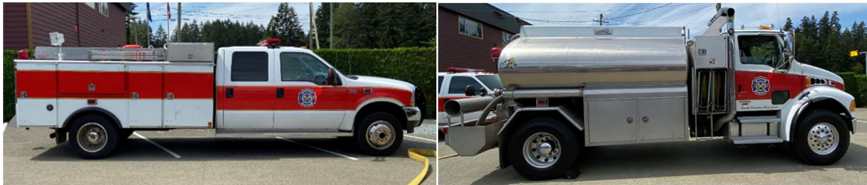
Tender 42 – 2005 Sterling Tender